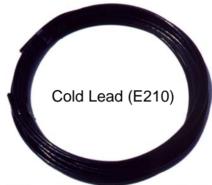
Cold Lead (E210)

Heatizon Systems 4403 South 500 West Murray, UT 84123 www.heatizon.com