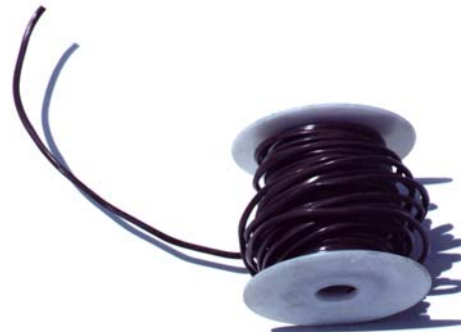
Thermostat Wire (M316)