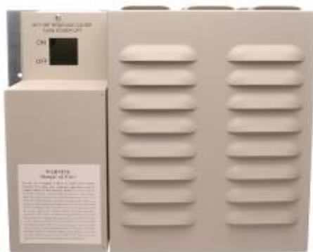
STARTING UP A CBX6 or CBX23 SERIES SYSTEM PAGE 6-2 to 6-6