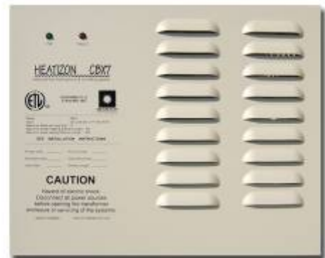
STARTING UP A CBX7 SERIES SYSTEM PAGE 6-7 to 6-8